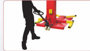
"Pallet jack" style device allows the lift to be moved wherever you need it.