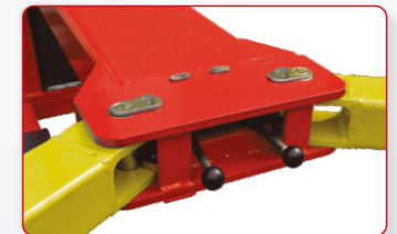
Arm locking device with easy to release handles.