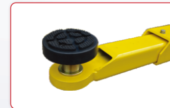
Features screw and insert rubber pads.