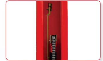
The chain protection cover prevents the chain from slipping off.