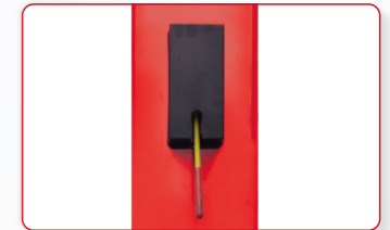
A manually locking release safety device controls the double locks.