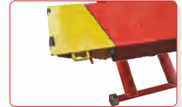
Adjustable approach ramps quickly extend the length of the platform.