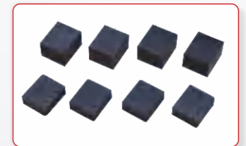
Both 1 1/2" and 3" height rubber pads are included as a standard issue.