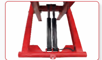
Two hydraulic cylinders and hydraulic safety locks.