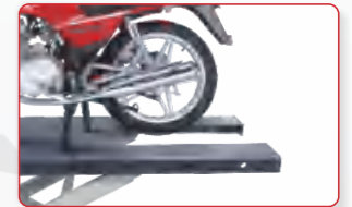
Rear Tire Removal Cover Removable platform cover plate is convenient for rear wheel changing.