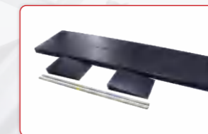
Optional Width Extension Kit Adds an extra width of 23 5/8" (600mm) on the platform to be suitable for three or four-wheel motorcycles. Kits No.: MC001