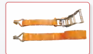
Optional Vehicle Securing Belt Tightens the vehicle before lifting. Kits No.: MC006