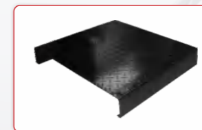
Optional Length Extension Kit Adds an extra 15 3/4" (400mm) length on the platform for the long axle vehicle. Kits No.: MC002