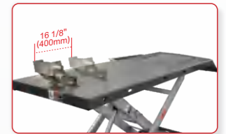
Front Wheel Vise Front wheel vise with an adjustable positioning distance of 16 1/8" (410mm).