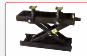
Optional Lifting Jack Lifting capacity: 1,100 lbs (500kg). Perfect for wheel removal. Kits No.: MC005