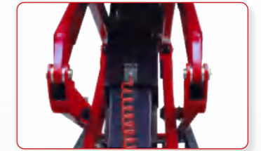
Automatic safety release.