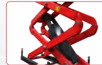
Strong tubing makes the lift safer and more durable than the competition.