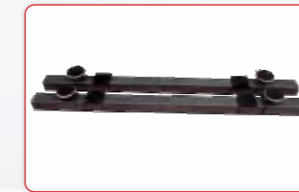
Leveling bar kits No.: SX703