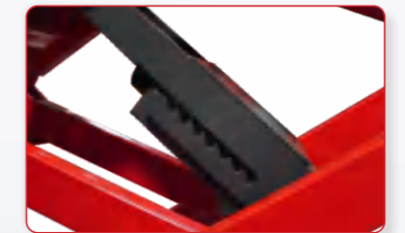
Mechanical Safety Locks.